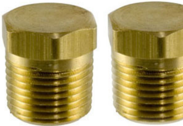
BRASS PLUGS STOP PLUGS