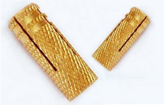
BRASS ANCHOR BOLTS / BRASS SLOTTED ANCHORS