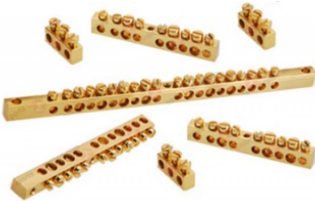
Brass Terminal Bars

We offer a wide range of Brass Terminal Bars from high quality material and with multiple ways/tunnels with metric screws combination headed. Our Brass Terminals and Brass Terminal blocks are supplied to various OEMs manufacturing electrical switchgears control panels relays and electrical enclosures.